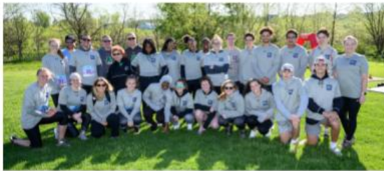
Take a Breath for Sarcoidosis 2019 Hosting Sponsor – DeJon Vineyard