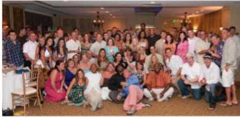
Flip Flop Festivus 2010 Hosting Sponsor – Tabrizi's

The Life & Breath Foundation thanks its many volunteers, supporters, and businesses, who have contributed to our 23 years of success.