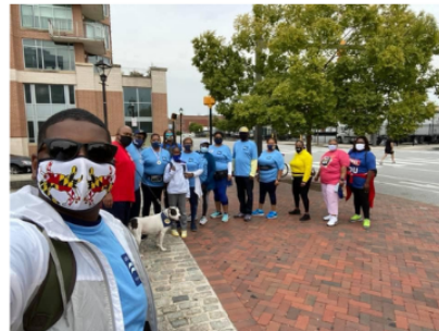
Take a Breath for Sarcoidosis 2021 Virtual 5k