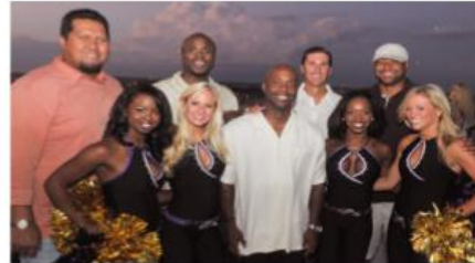
Flip Flop Festivus 2011 Hosting Sponsor – Turner Development & Silo Point